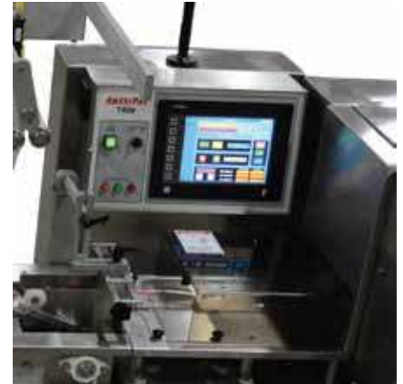
Quick Changeover | Simple machine control layout and adjustable former.

The Series 150 is easily customized to meet specific packaging needs and is available in right or left hand configurations.