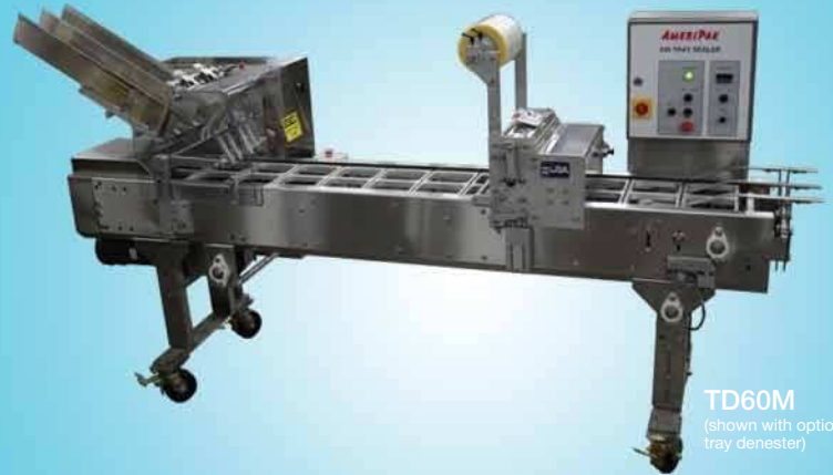
TD60M (shown with optional tray denester)