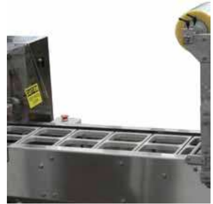
Wide film width | Allows for multi-lane configuration