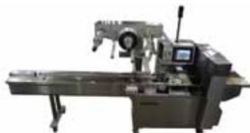
Series 150 Horizontal Flow Wrapper

Units wrapped and sealed at speeds up to 250 ppm