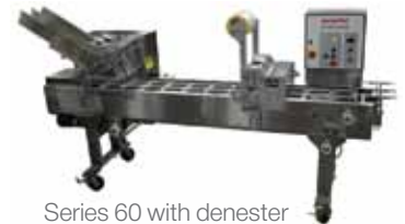
Series 60 with denester